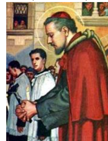
November 4 Patron of Seminarians and Catechists

Oh God, Maintain in your people that spirit with which you inspired your Bishop St. Charles, so that your church may be constantly renewed, conforming itself to Christ and manifesting Christ to the world.